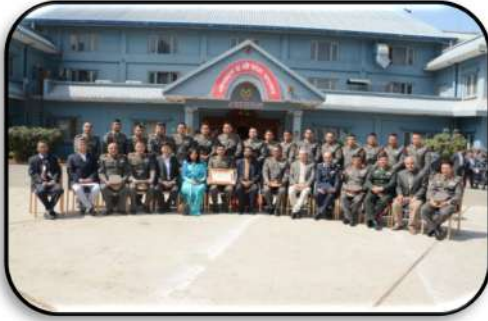
Graduation Ceremony of 1 st APF Command and Staff Course