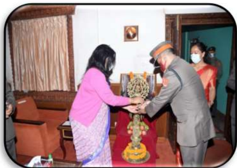
Opening Ceremony of 6 th APF Command and Staff Course