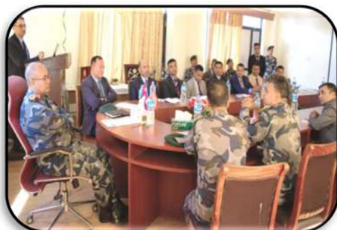
Post FST interaction between Inspector General and Student Officers