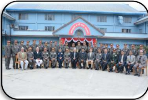
Graduation Ceremony of 3 rd APF Command and Staff Course