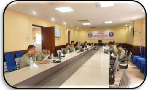
Revenue Tripureshwor visit of 6 th Batch