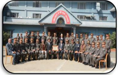
Graduation Ceremony of 2 nd APF Command and Staff Course