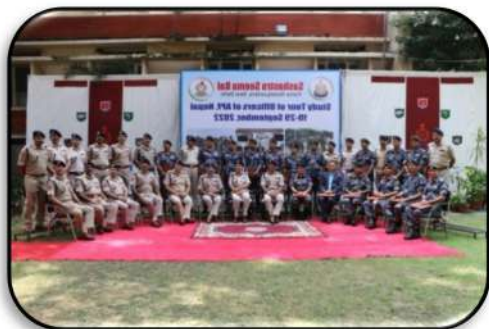
Foreign Study Tour 6 th Batch