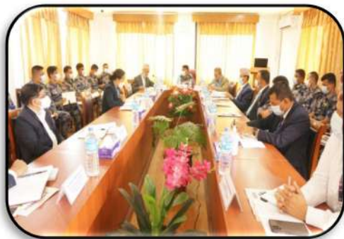
Panel Discussion on Border Management and Security 2078