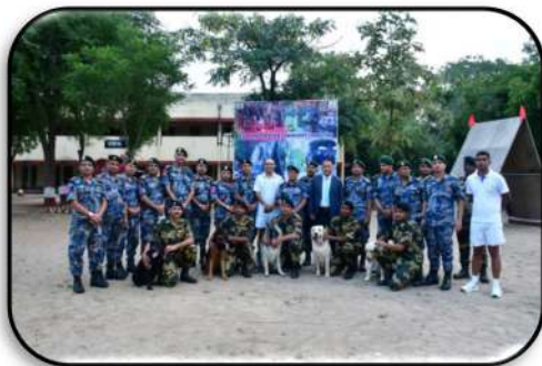
Foreign Study Tour 6 th Batch