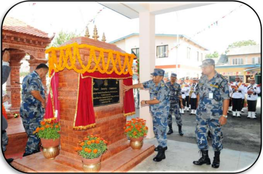
Inauguration of APF Command and Staff College by Former IG Koshraj Onta