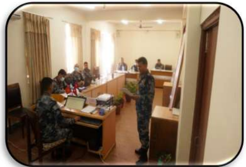
INT Exercise of 6 th Batch