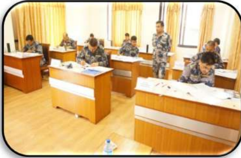
Agenda and Minutes of Conference of 6 th Batch