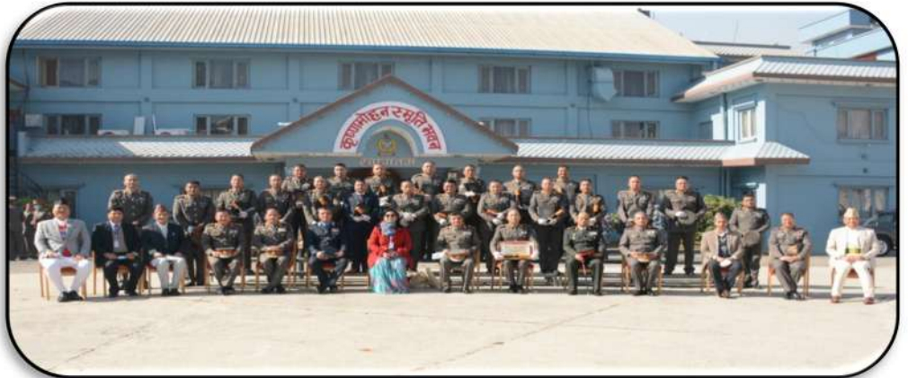
Graduation Ceremony of 5 th APF Command and Staff Course