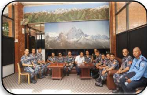
Tribhuvan International Airport Visit of 6 th Batch