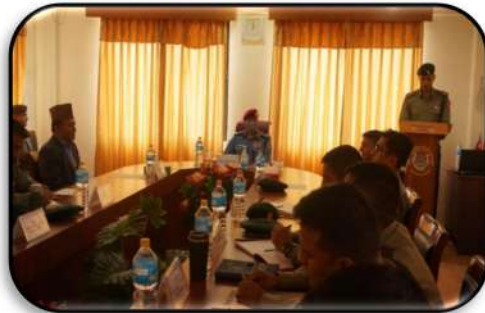
IGP Shailesh Thapa Kshetri Interacting with Student Officers of 6 th Batch