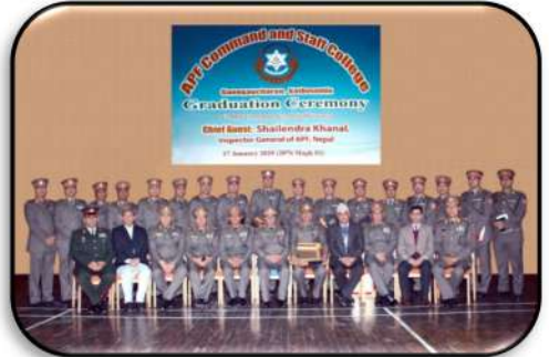
Graduation Ceremony of 4 th APF Command and Staff Course