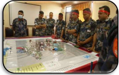
War Game during Campaign Planning Exercise of 6 th Batch